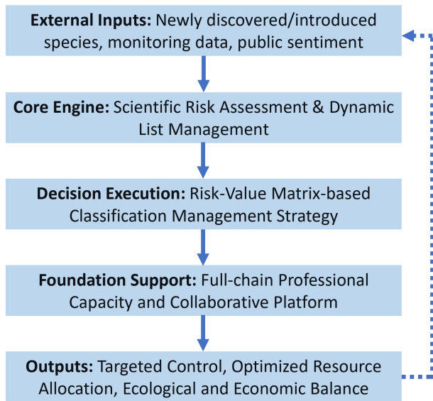
Fig. 1 "Intelligent Governance" Model for Biological Invasions

from Ruzhou acted on this principle, the outcome would have been different.